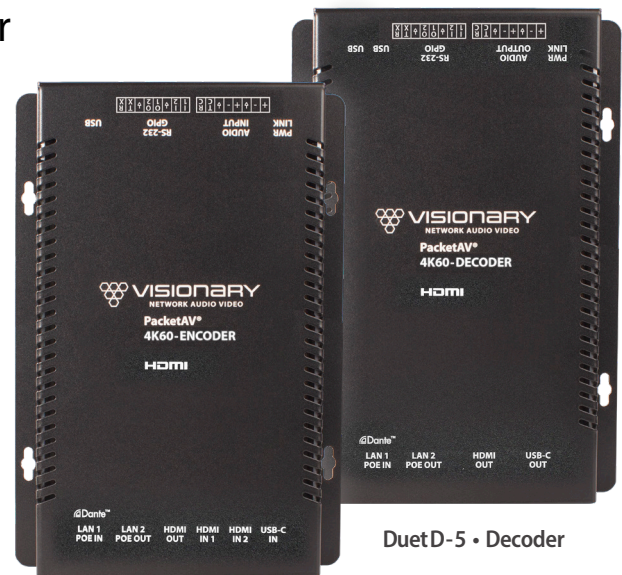
DuetE-5 • Encoder

Compatible with industry-standard IP networks, Visionary's PacketAV® and PackeTV® products can be deployed on existing enterprise networks or separate private networks for dedicated video traffic. This versatile approach simplifies installation while