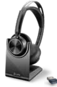
VOYAGER FOCUS 2 UC WITH CHARGE STAND